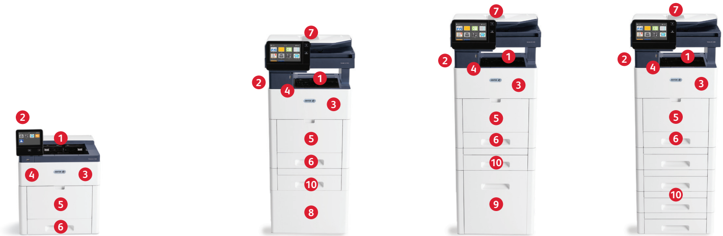
Xerox® VersaLink C500 Color Printer Print.